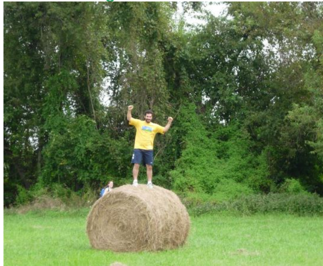
MOC member conquers an unruly hay bale during a hike at Susquehanna State.