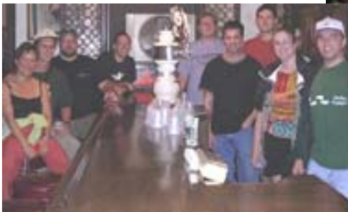
Counterclockwise from top left: MOC sailors pose with their ship, the envy of many a skipper; "Yes, the end of the brewery tour includes samples"; Tubers await the commencement of the MOC's unofficial favorite pastime.